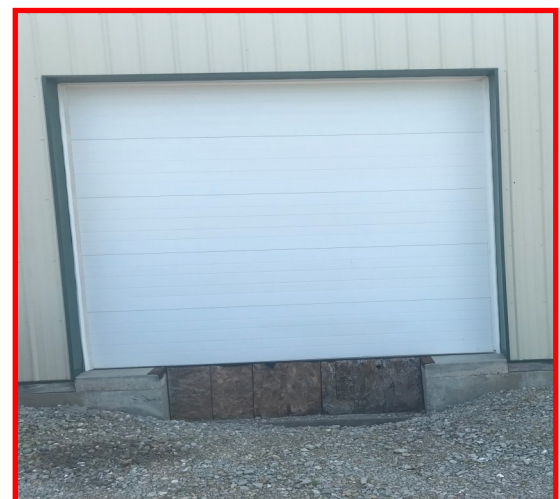
The Operations & Maintenance Center will have a dock for storage and cross loading needs.

Based on this feedback StoneBridge has grown from 4 box trucks & 4 vans to 10 box trucks and 5 vans. They forecast adding an additional 4 - 5 box trucks for an overall fleet growth of 250% . The StoneBridge Team has grown from 7 employees to 25 for an overall growth of 357% . StoneBridge is now averaging 140-175 loads per month for a growth of 258% . With this, the feedback remains the same . . . MORE AVAILABILITY - MORE CAPACITY - MORE SERVICES. "We are still hiring competent drivers who fit our model and are adding a LARGE TANDEM AXLE BOX TRUCK that can haul up to 20,000LBS. In two - three years, we hope to add full size 53ft trucks because OUR CUSTOMERS ARE ASKING US TO DO SO, both old and new."