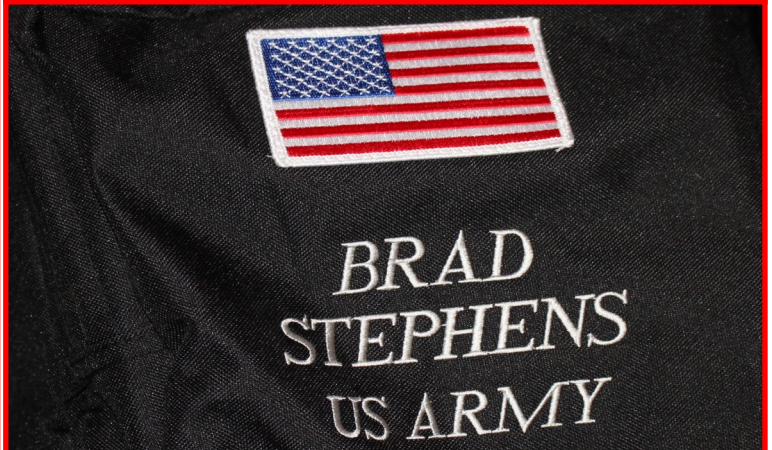
The StoneBridge Duffle Bag is embroidered with the Logo, American Flag, Operator's name, and branch of military service.