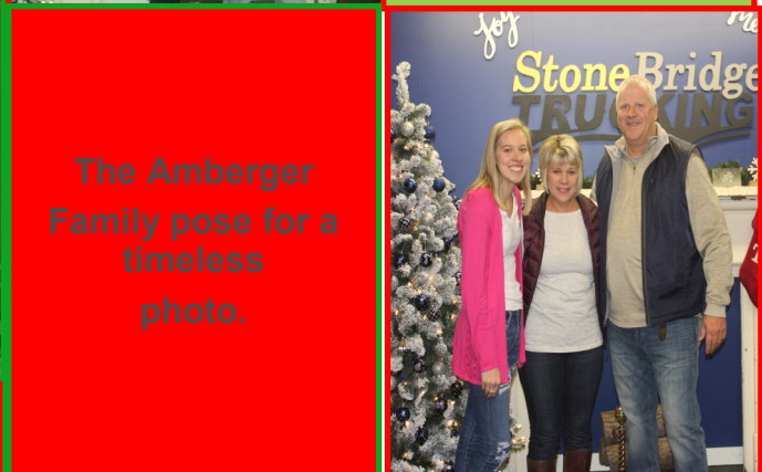
The Amberger Family pose for a timeless photo.