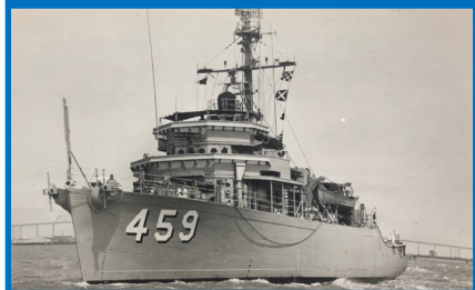
Commissioned USS Nimble - 1955